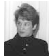
Kerry Kennedy Cuomo

photographs of human rights leaders and activists from around the globe. A play, based on the book, was performed in Washington, DC and was presented on PBS on October 8, 2000. A video of the play will be included as part of an educational package to be distributed to high schools and universities. For more information on this project or to get involved, visit www.speaktruthtopower.org .