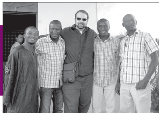
The author (center) with young Christian peacemakers from Kaduna, Nigeria

That day we did nothing but watch and listen, yet the youth made known that our interest in their efforts encouraged them in the positive work they were doing.