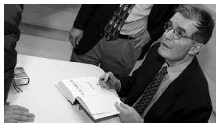
Sorensen signs copies of his new memoir, Counselor: A Life at the Edge of History, during a January appearance at Brandeis.

group of students in 1998. Since then, the Ethics Center has sent 68 students on internships worldwide. For more information about this program, see www.brandeis.edu/ethics/atbrandeis/sorensenfellowship/index.html .