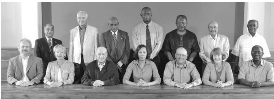
International judges attending BIIJ 2009, in the courtroom of the Caribbean Court of Justice