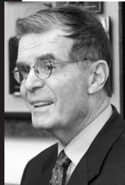
Theodore "Ted" Sorensen, the founding chairman of the Ethics Center's international advisory board

academic and experiential learning for selected Brandeis University sophomores and juniors. After being chosen in a competitive application process, students take a course in the spring as academic preparation for an internship. During the summer, fellows experience an internship of their own design in an organization anywhere in the world, for which they receive a $4,000 stipend ($3,500 for a domestic internship). After they return, students take a course in the fall and write an essay focused on their internship experience, which is published in a compilation by the Center.