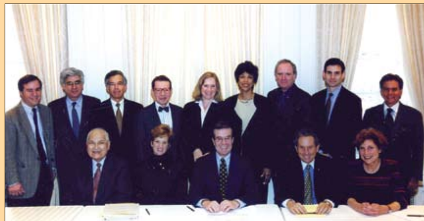
The International Advisory Board for the Ethics Center convenes for the first time on March 7, 2000, in New York City.