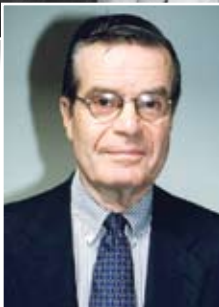
(Above) The inaugural recipients of the Ethics Center Student Fellowships, launched in 1997 to provide Brandeis undergraduates the opportunity to work abroad and to integrate their experience with coursework on campus. • (left) Theodore Sorensen, international lawyer and former special assistant to President John F. Kennedy, has chaired the Center's international advisory board since its inception.