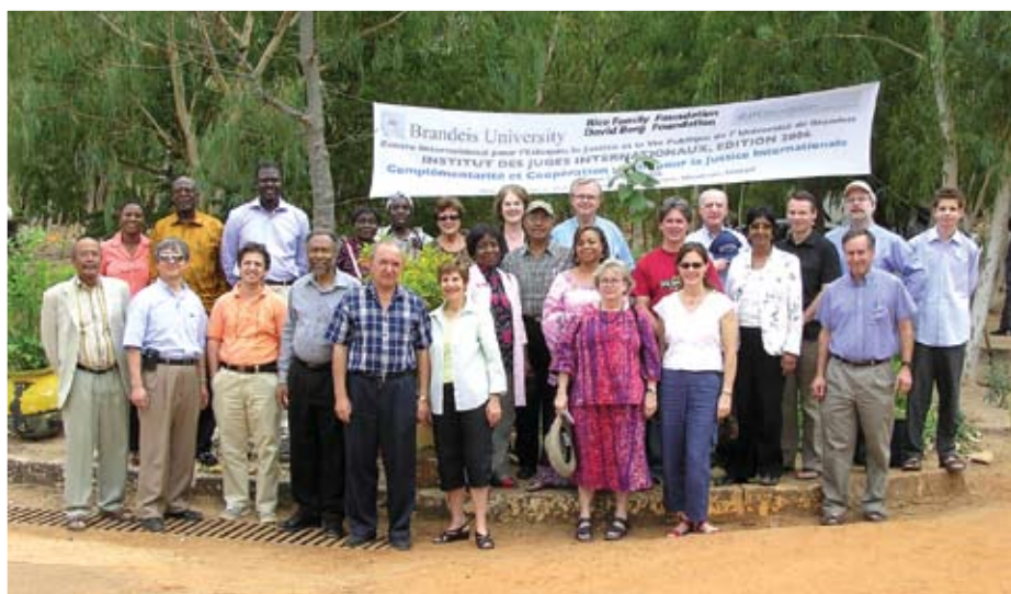
A flagship program of the Center, the Brandeis Institute for International Judges hosts jurists who serve on the world's international courts and tribunals. Here judges gather in Senegal during the fourth BIJ in January 2006.

The Center's activities vary widely — by location, by discipline, by format, by participants. Binding them together is the ongoing effort to create and disseminate knowledge. The Center is not a think tank, producing policy reports and seeking short-term influence among power brokers. Nor is the Center a non-governmental organization, designed to create programs with active impact at a community level. It is instead a university center, focused on helping individuals and organizations developing the clearest thinking that can lead to action. Its emphasis is not on imagining utopian solutions, but instead on developing thoughtful and effective approaches to complex problems. It is this sense of "approach" that characterizes the Center's work: what matters is finding the means and methods to move forward towards humankind's most ambitious goals.